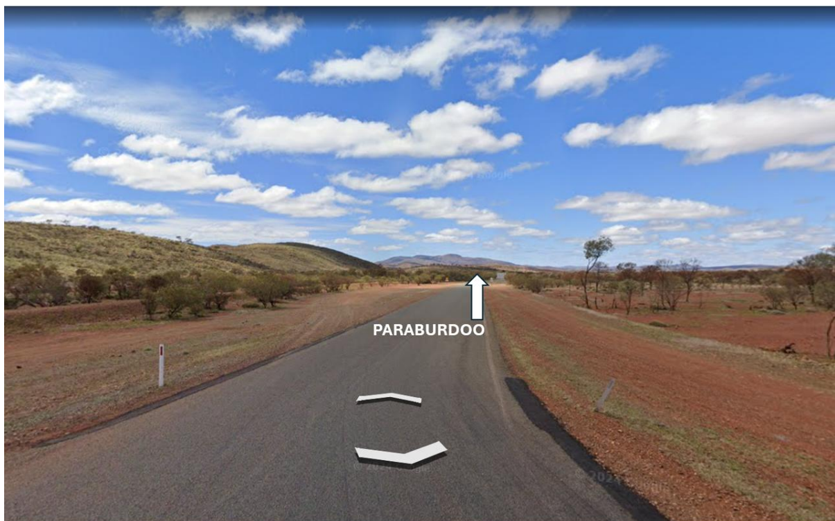
Area identified (left side of road) as an official pull over bay and rest area, heading towards Paraburdoo from the Nanutarra-Munjina Road