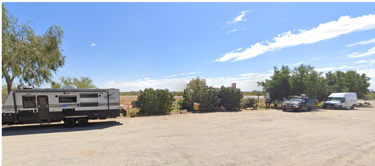
Shaded rest area opposite Nanutarra Roadhouse and amenities (above).

At this location, people park in the shade post refuelling their vehicles, obtaining supplies, and having a rest stop.