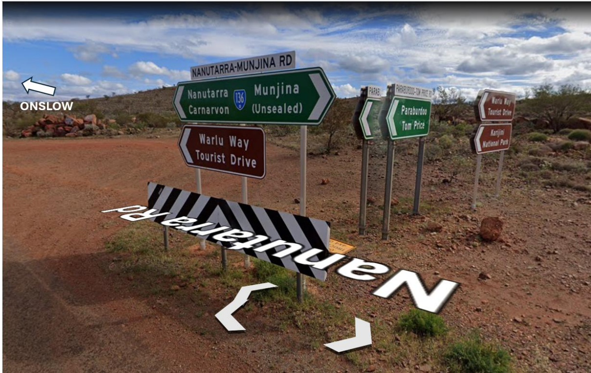
Signage at the intersection of Paraburdoo Road and Nanutarra-Munjina Road