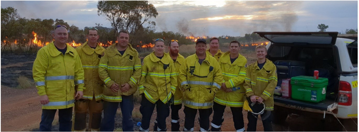
Tom Price FRS & BFB working together

Congratulations to the Tom Price Fires & Rescue Service and the Tom Price Volunteer Bush Fire Brigade who have been nominated as Finalists in the Team Achievement Award in the 2018 Department of Fire and Emergency Service Fire Fighting Awards which will be held in conjunction with the Australasian Fire and Emergency Service Authorities Council conference in Perth during September 2018.