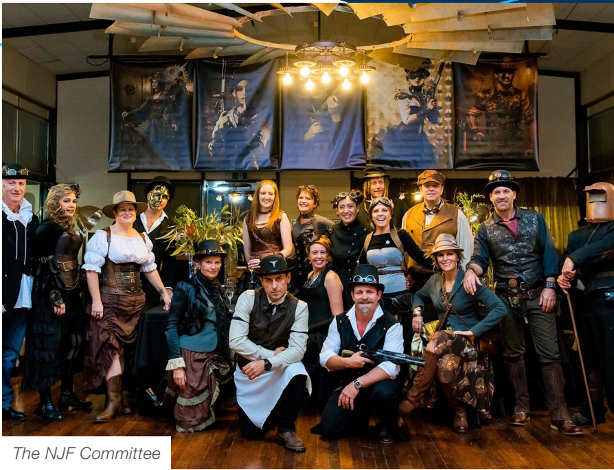
The NJF Committee