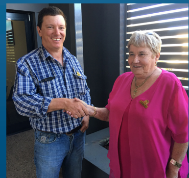
Cr White welcomes Cr de Pledge