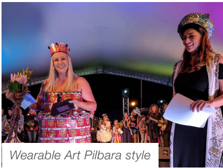
Wearable Art Pilbara style