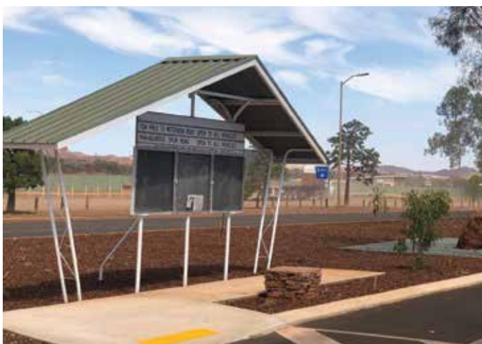
Now and Then: the original Information Bay

This activity met Community Goal 2 of the Corporate Business Plan, well managed tourism.