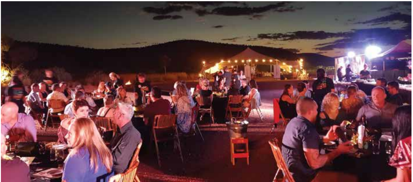
Visitors enjoying the experience of culture, art, music and cuisine