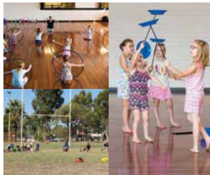
Enjoying the school holiday fun