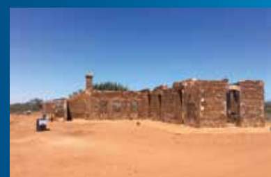
Signs now tell the stories of Old Onslow