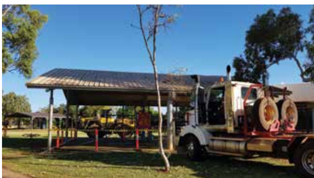
Setting the scene

Congratulations to the teaching staff who put so much effort into providing the students with a learning opportunity, and well done to all of the students who put their heart and soul into their writing.