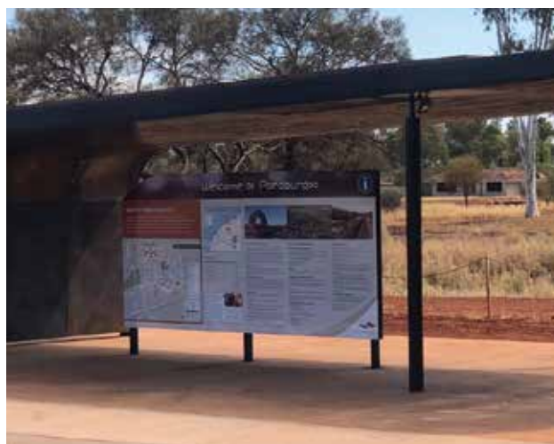
Welcoming tourists to Paraburdoo