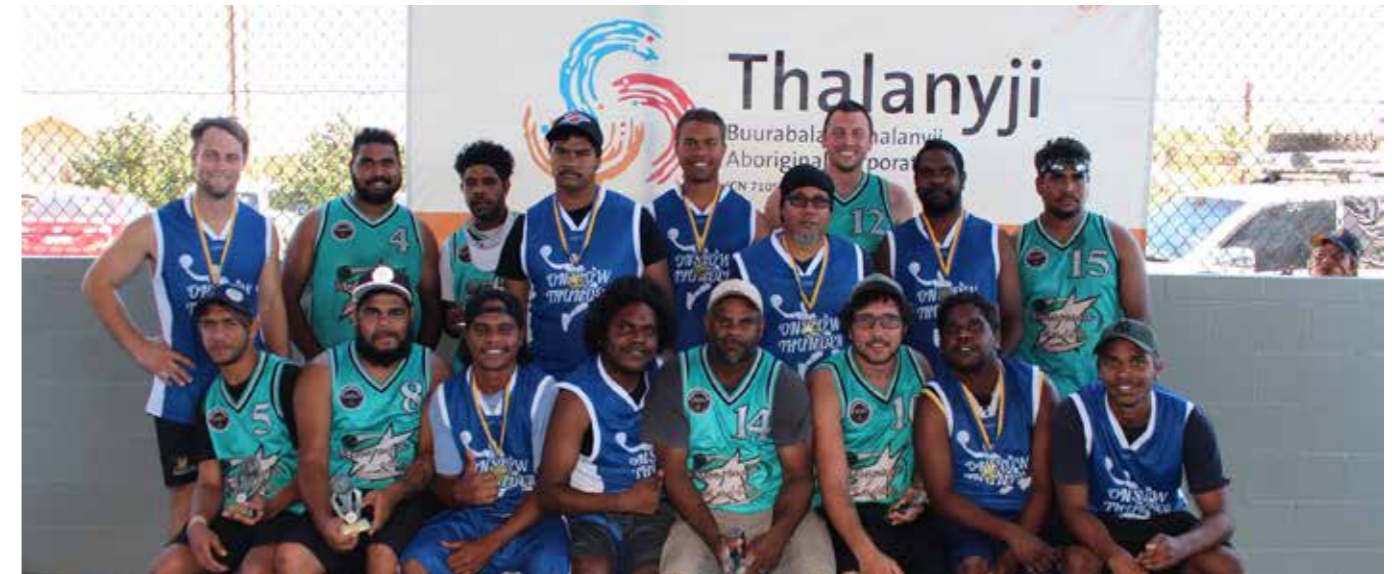
Mayuga Majik and Onslow Thunder

Seventeen basketball teams gathered in Onslow in August to showcase their skills and strive for the winning trophy. With some of the region's best basketball players in town for the annual Onslow Basketball Carnival, the thrill of the competition made for an exciting weekend.