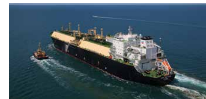
First gas heads to Japan

The Shire of Ashburton congratulates Chevron on achieving this significant milestone and looks forward to continuing the community partnership.