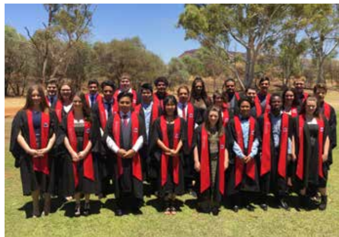
Tom Price Senior High School recently celebrated and recognised the achievements of Year 12 students who have performed so well across many disciplines; the subject areas within the school's curriculum and in the numerous extra-curricular activities offered.

The Valedictory ceremony began with students filing into the high school's Performing Arts Centre, dressed smartly in their graduation gowns and sashes, whilst a presentation was played on the screen showing their cute baby photos.