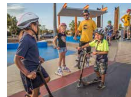
This activity met Goal 1 of the Strategic Community Plan, Vibrant and Active Communities

The support from industry and local businesses in Onslow has been exceptional, and we value their contribution to this year's Passion of the Pilbara.