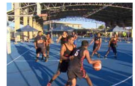
Onslow Basketball Carnival

Winner: Shooting Stars Runner up: Onslow Heat