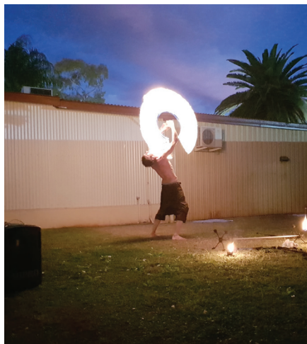
School holiday fun