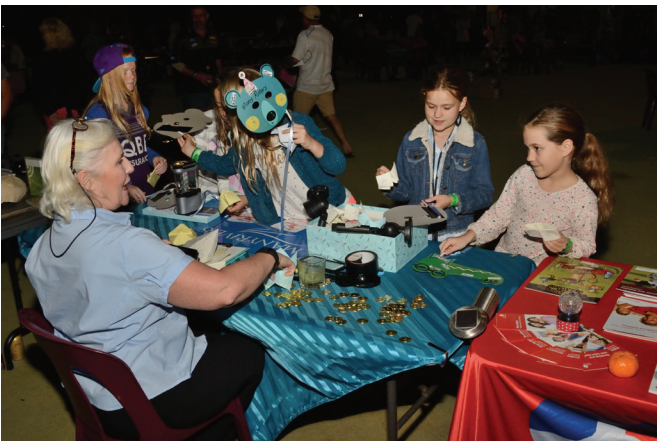
Onslow enjoyed a Night on the Green