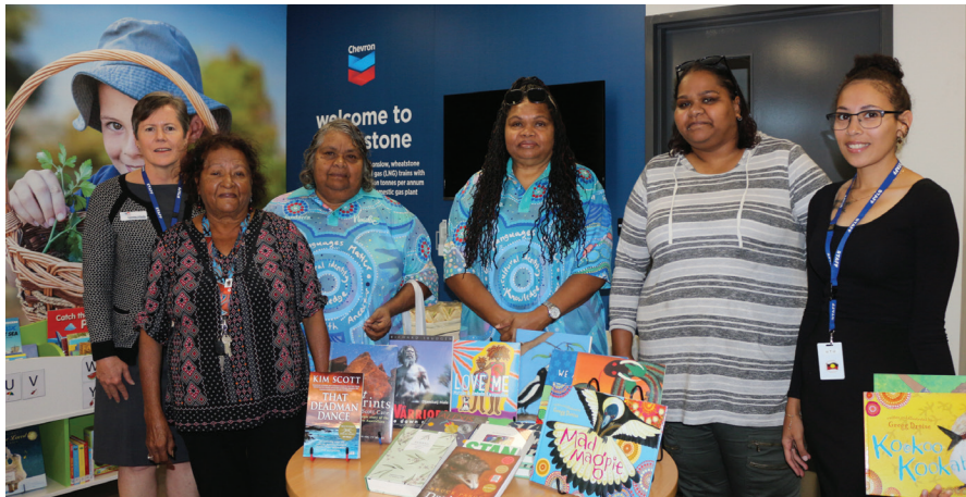
Buurabalayji Thalanyji Aboriginal Corporation's generous donation

NAIDOC Week was a hive of activity in the Shire of Ashburton as local communities joined in the celebrations of culture, history and achievements of Australia's Indigenous people.