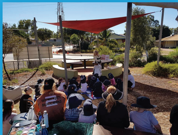
Being kept busy with Story in the Park and Lego Master builders

Monday to Friday 9am to 4pm Saturday 10am to 12pm