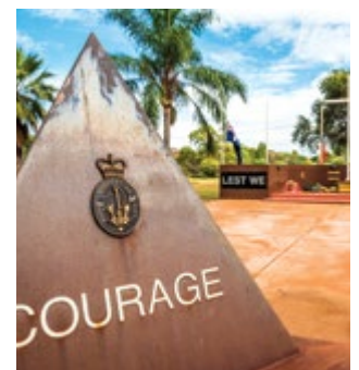
Crowds gather to commemorate the ANZACs