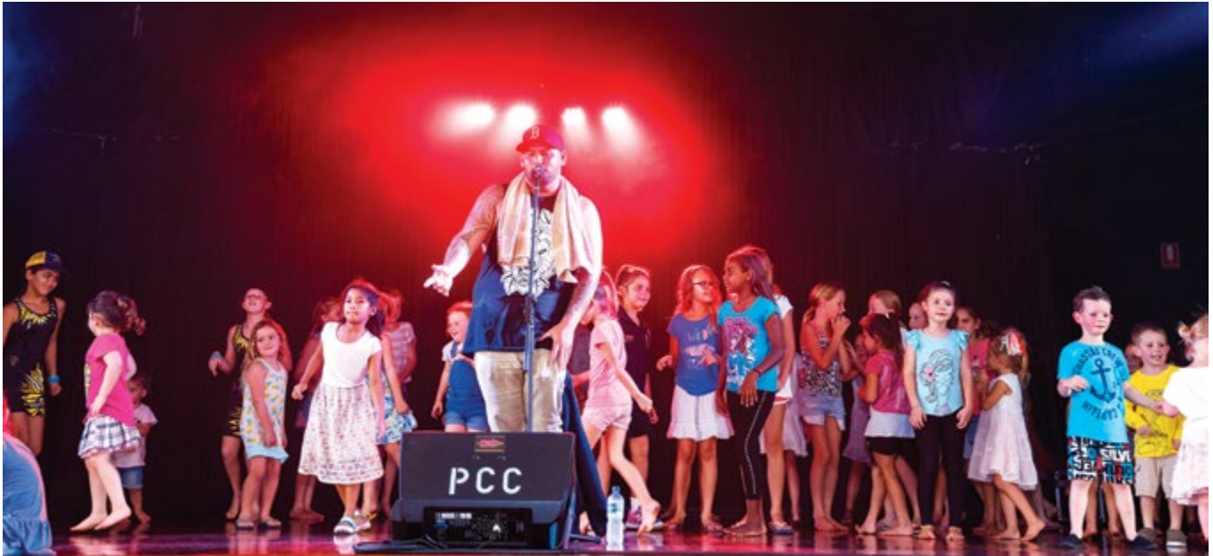
Big T entertained Paraburdoo.