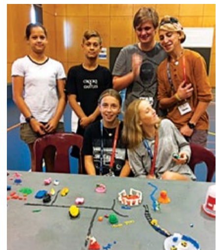
"Youth, The Voice" participants.

A 'Youth, The Voice' workshop will be held in Tom Price, for Paraburdoo and Tom Price Youth, in the coming months so stay tuned for more details.