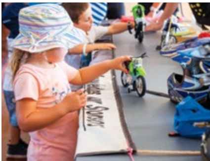
Giving it a go at the Tour de Tom Price.