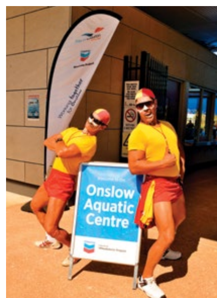
Onslow celebrates with a community pool party

The Shire of Ashburton, in partnership with the Chevron-operated Wheatstone Project and the Department of State Development, recently celebrated the opening of the Onslow Aquatic Centre.